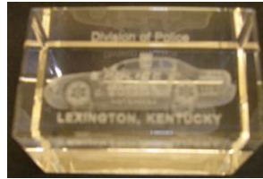
Police cruiser crystal blocks $18.00 each.