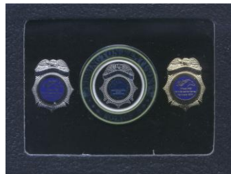
Your choice of Public Safety pin set with Police, Fire and Correction pins or WEG pin set with challenge coin, silver and gold WEG badge pins for $12.00 in a free display box.