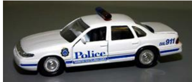
1997 Road Champs Die Cast Cruiser - $9.00 each